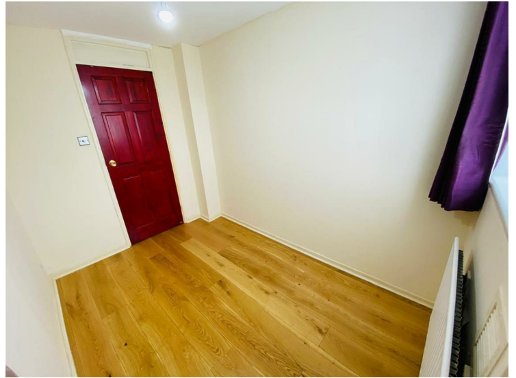
Rear aspect double glazed window, radiator, wood effect flooring.